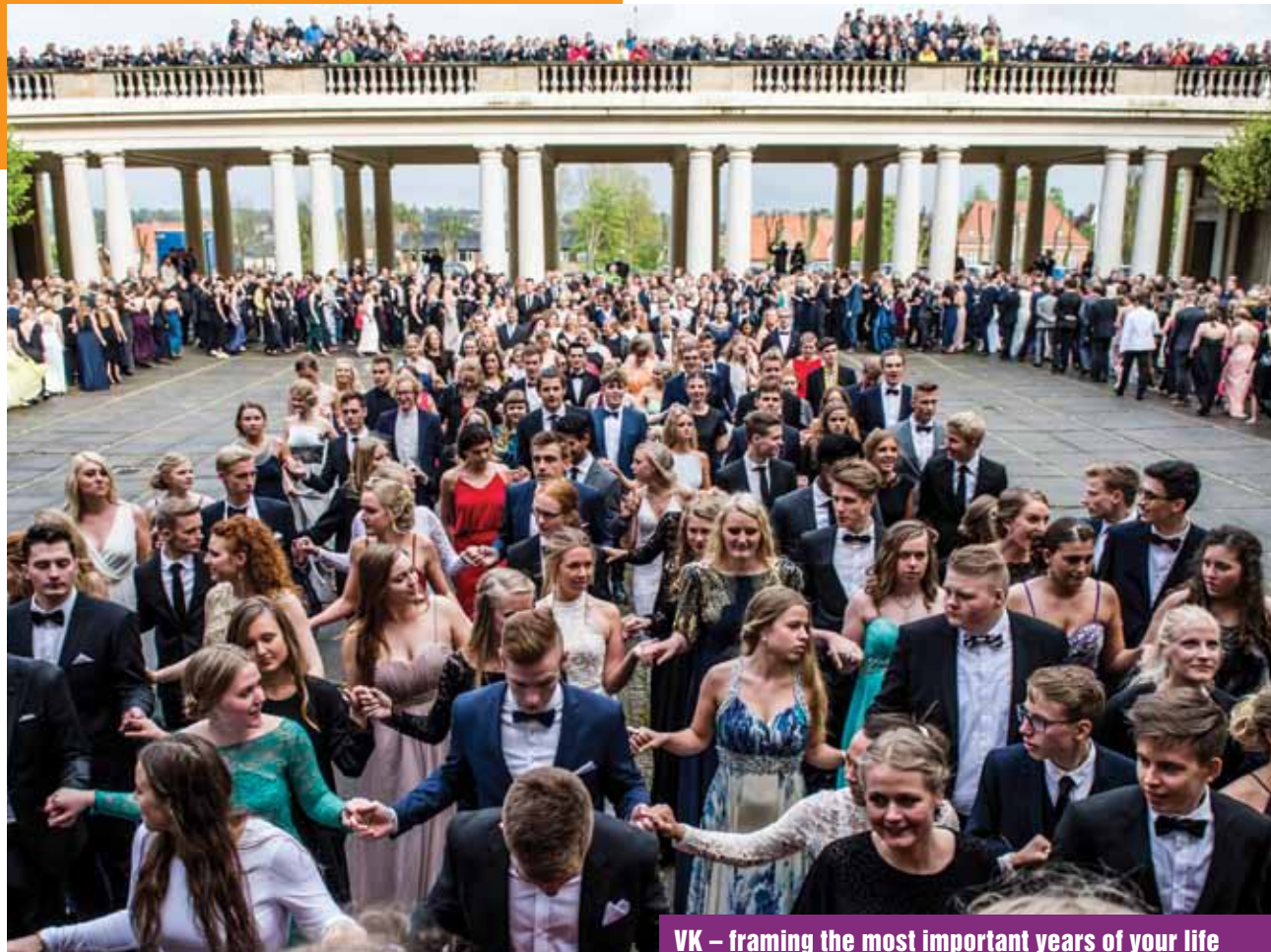
VK – framing the most important years of your life