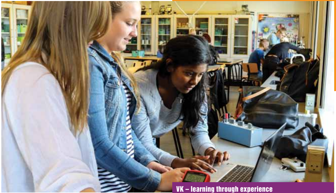
VK – learning through experience